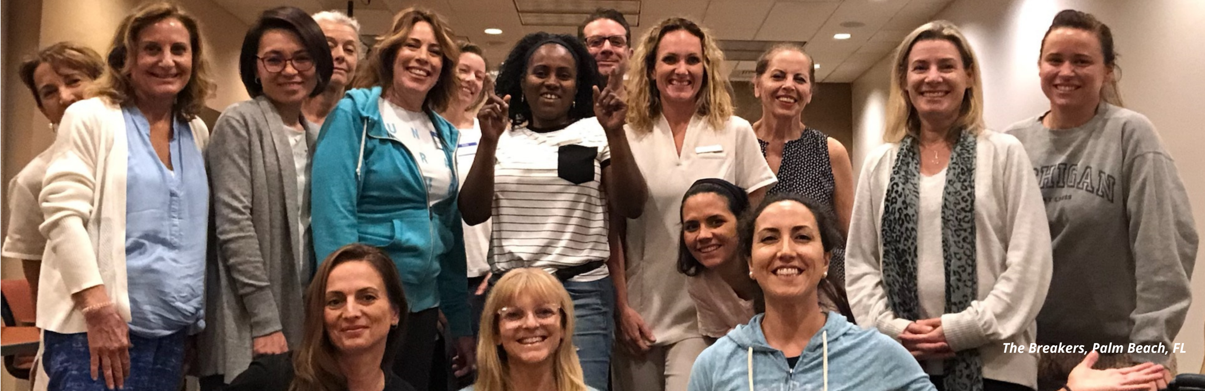
The Breakers, Palm Beach, FL